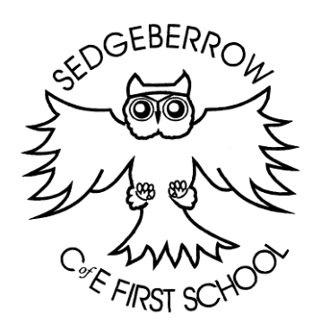
"A school which makes you long for childhood"

We have had an excellent start to the term at Sedgeberrow welcoming 30 children into Reception all of whom are settling in very quickly. During the holidays we had our entrance, library and corridor refurbished so the school is looking very nice.